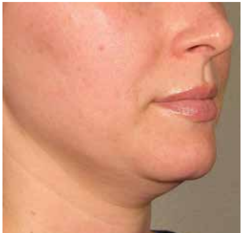
AFTER one Ultherapy treatmen