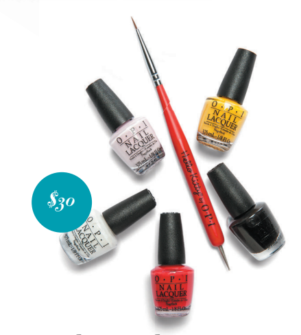
luxe to less Tom Ford Lips & Boys Collection, $48 each. The Ritualist Essential Travel Kit, $40. O.P.I Hello Kitty mini pack, $30.